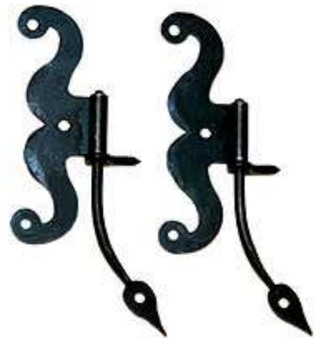
Moravian Rat Tail Hinges