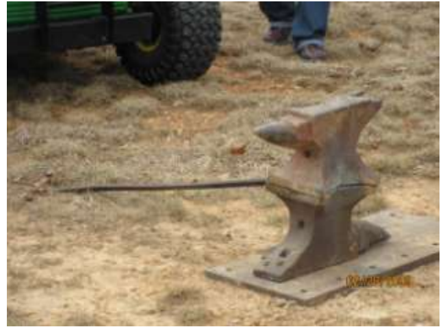
Anvil's ready to be fired.