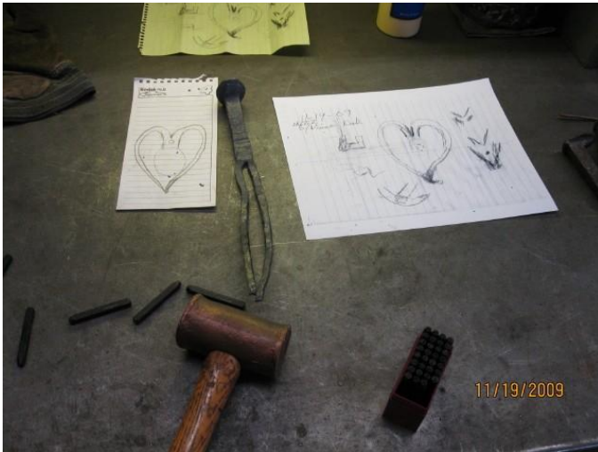
Drawn out and chisel cut

This is the sum total of about 4 hours of work and the forge. I drew the spike out about 5" before I split it with a hot cut chisel. Then drew the splits out to about 7" before making the 90 degree bend in the vise. I used a 1 1/2 " mandrel in the hardy hole to bend the top lobes of the heart. I chickened out on welding the bottom together as it looked good as is and I thought about overlapping it and riveting it together with a small brass rivet, but didn't like the look of it overlapped, so I just left it but at the bottom. I couldn't get in with a file to really clean up the "V" at the top of the heart and it was somewhat obscured by the screw so that detail wasn't a do or die issue. When making this detail it is best to chisel and fuller it before you bend it (Hind sight at work). I stamped "2009" on one side of the spike and "WF" (Warwick Forge) on the other side, as I do with door knockers; I mounted it on a board. This keeps the screw from getting lost and lets you see the "negative space", and attaches my business card to the item.