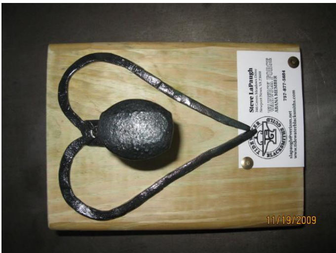
Mounted and ready, front view