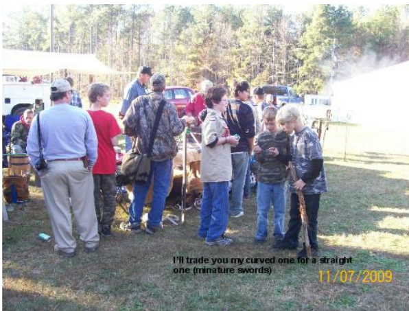
I'll trade you my curved one for a straight one (miniature swords)