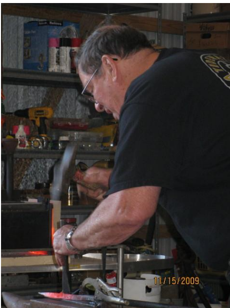
It's in the details!