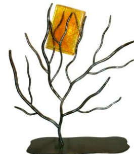
Fire Tree Small