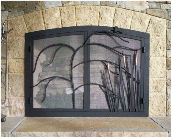
Outdoor Fireplace Screen