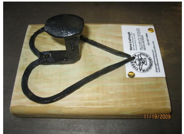
Mounted Side view