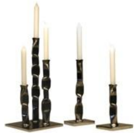
Collection of Pipe Candleholders