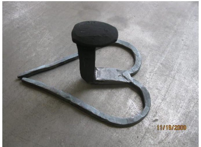
Ready for mounting